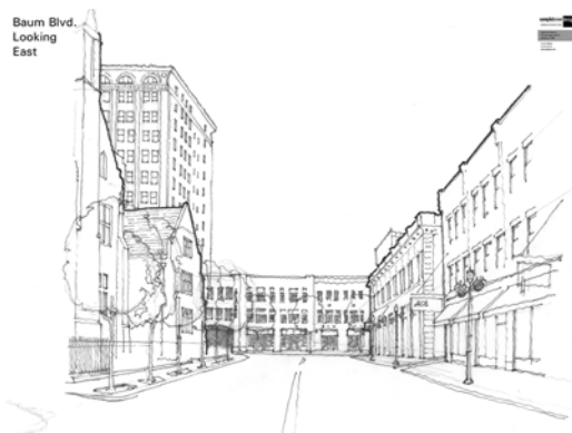
Baum Boulevard looking East toward a proposed new parking garage