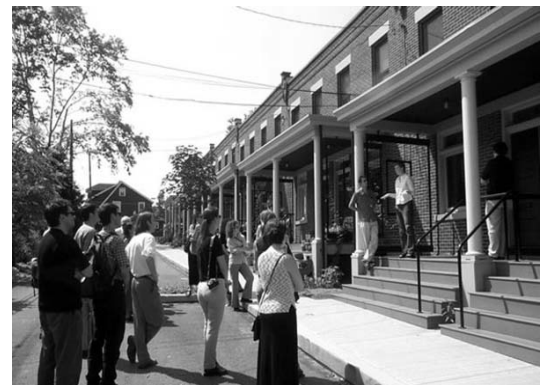
Clarendon Place after renovation

All 10 townhouses were sold, achieving the neighborhood's goal of increased owner-occupancy and long term residency. Six units were purchased by low- to moderate-income buyers. The 2-bedroom homes sold for $95,500 to $98,500 with deferred second mortgages; the 3-bedroom homes sold for $130,000. New homeowners moved into Clarendon Place from New York City and from the neighborhoods of Sewickley, Fox Chapel, Shadyside, Oakland, and Friendship within the Pittsburgh region.