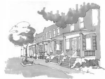
Clarendon Place sketch.

Friendship Development Associates (FDA) requested assistance from the CDCP to support the redevelopment of row houses dating from 1910. These structures were in poor condition, suffering from mismanagement by an absentee landlord. The properties were the site of drug- and gang-related activities, further endangering the rest of the neighborhood.