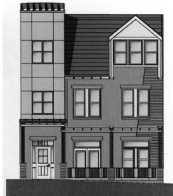
Sojourner House elevation

In 2002, the Sojourner House community organization was invited by East Liberty Development, Inc. (ELDI) and Negley Place Neighborhood Alliance (NPNA) to build a Sojourner House MOMS project in their neighborhood. This partnership's goal was to bring a residential facility to the area that would be the site of a permanent supportive housing program for homeless, mentally ill and substance-abusing women and their children. This situation was a novel one for Sojourner House - never before had a neighborhood organization actively initiated the process of bringing a supportive housing project into their community.