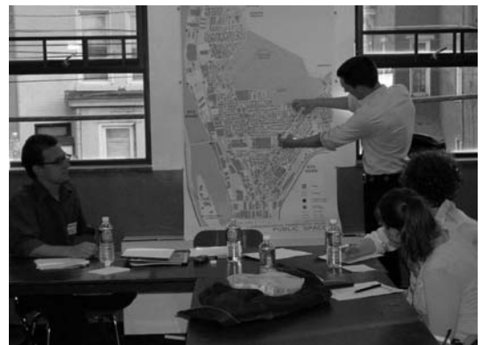
Community meeting participants discuss the neighborhood.

Lawrenceville Planning Team's grant retained the services of a design team lead by Pfaffmann + Associates, and included Brean Associates and Valentina Vavasis Consulting. Working with the Lawrenceville planning team, the design consultants developed a series of recommendations that addressed residential and business districts, riverfront development, industrial sites and public open space. Currently, Lawrenceville Corporation is developing signage for the primary neighborhood gateways as identified by the Community Plan.