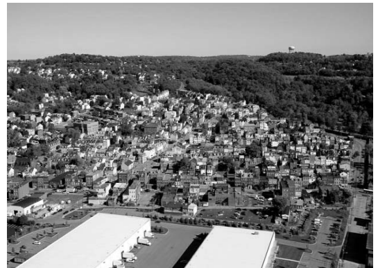
Aerial view of Lawrenceville neighborhood; Industrial abutting residential.

In the spring of 2002, the Lawrenceville Corporation contacted the CDCP with interest in generating a community plan in order to develop a broad-range, long-term strategy to guide neighborhood transformation and growth.